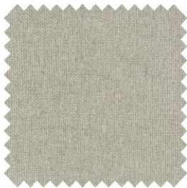
shell 196 (new colour)