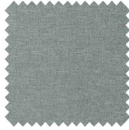
lightgrey 60 (new colour)