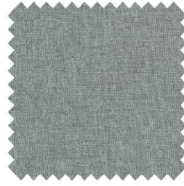
ashgrey 40 (new colour)