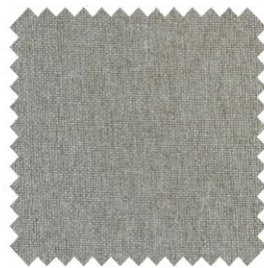
desert 109 (new colour)