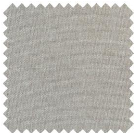
beige 05 (new colour)